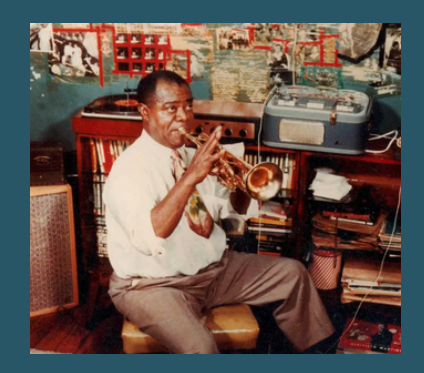
NYTIMES 2018: ARMSTRONG'S LIFE IN LETTERS, MUSIC AND ART