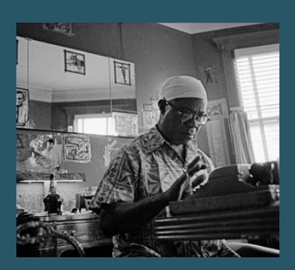
BOSTON GLOBE 2022: MY WEEKEND WITH LOUIS ARMSTRONG