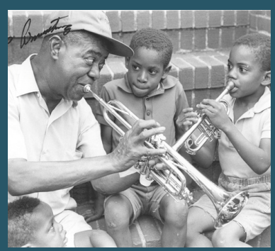
WASHINGTON POST 2020: LOUIS ARMSTRONG'S MUSEUM HAS GONE SILENT, BUT 'POPS' IS STILL TALKING