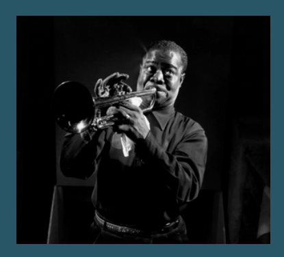
NYTIMES 2022: LOUIS Armstrong's last laugh